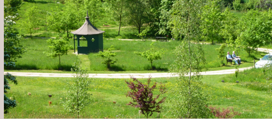
Westall Park Woodland Burial, Redditch, Worcestershire

We recommend choosing an ANBG member because, by agreeing to abide by the Code of Conduct, members are committed to ensuring the best possible service for families.