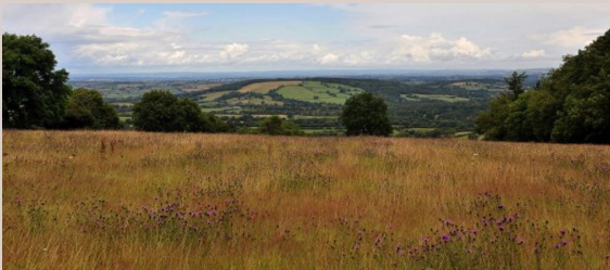
Higher Ground Meadow, Dorchester, Dorset.

Copies are available from each member site or from The Natural Death Centre.