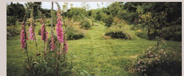
Great Bradley Cottage NBG, Tiverton, Devon

Sustainable methods are used in maintaining natural burial grounds and the surroundings are kept as natural as possible to encourage biodiversity. Land used for natural burials continues to benefit the community, either through its eventual use as a wildlife reserve and green space or its continued agricultural or forestry productivity.